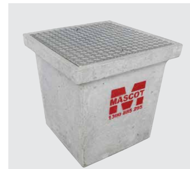
GMS Class B Cover