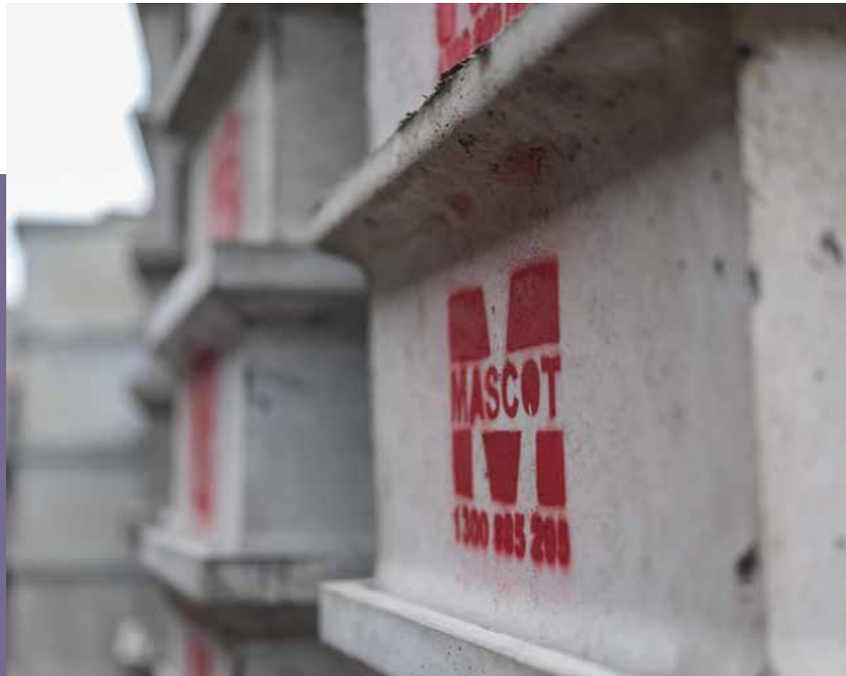
Solid Concrete - 50 NPA - Pits, Lids & Risers .....Page 73 – 75