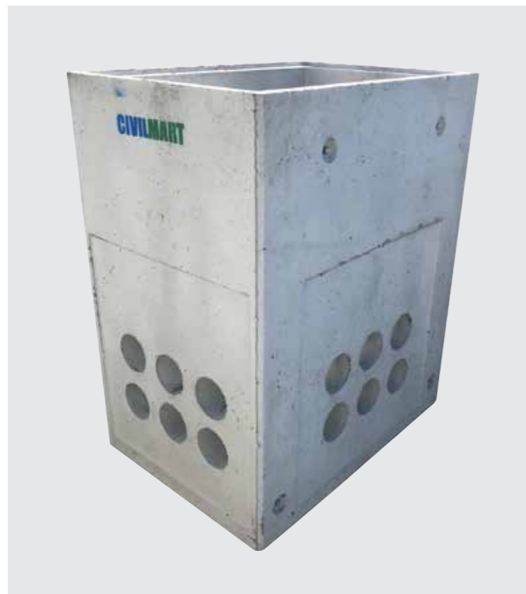
600mm x 900mm x 1200mm Concrete Pit - Complete with custom holes