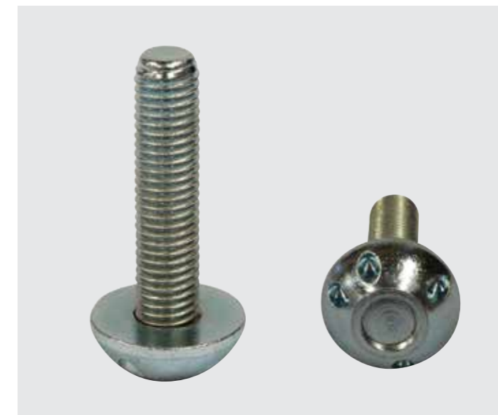
28mm Stainless Steel Barri Bolt