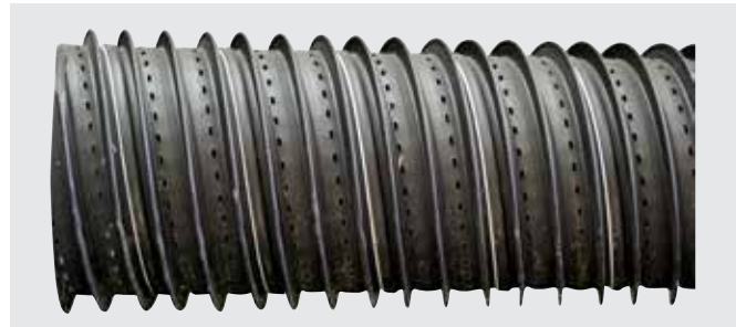
Plastream Slotted 6 Metre Pipe