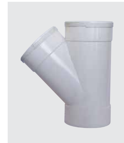
Stormwater PVC F&F Junction