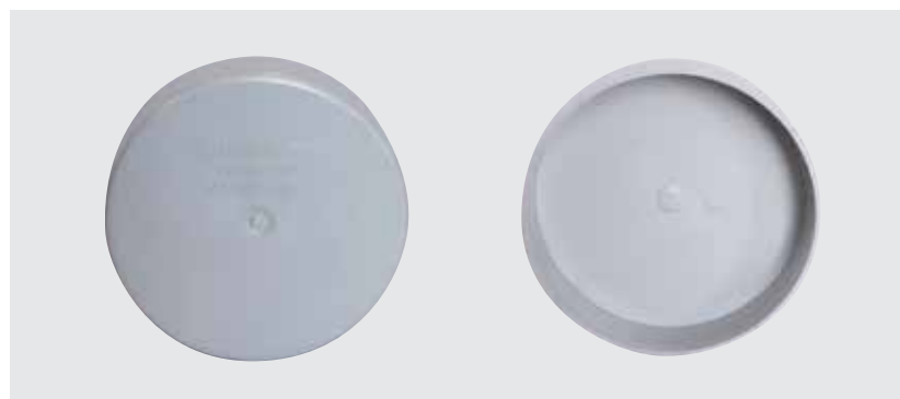
Stormwater PVC Push on Caps