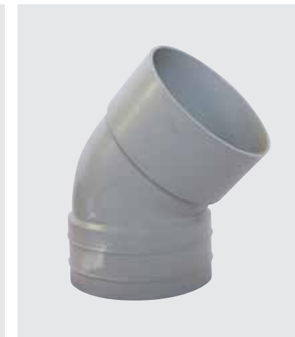
Stormwater 45° PVC F&F Bend